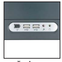
Top Access USB, Firewire, & Audio